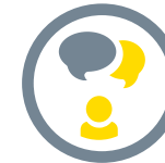
Effective bilingual communicators