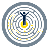
Providing Engaging and Challenging Learning

Working on Focus Areas. The action-oriented items in this plan are built around three focus areas and initiatives that represent the work to ensure the strategic priorities become a reality. EPISD is: