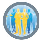
Lead with Character & Ethics

Working on Focus Areas. The action-oriented items in this plan are built around three focus areas and initiatives that represent the work to ensure the strategic priorities become a reality. EPISD is: