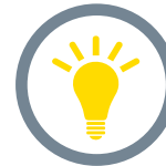
Critical, knowledgeable and creative thinkers