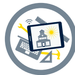
Modernizing Learning Environments