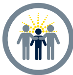
Building Strong Supports