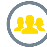
Responsible leaders and productive citizens