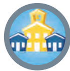
Great Community Schools