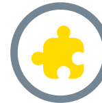
Informed problem solvers