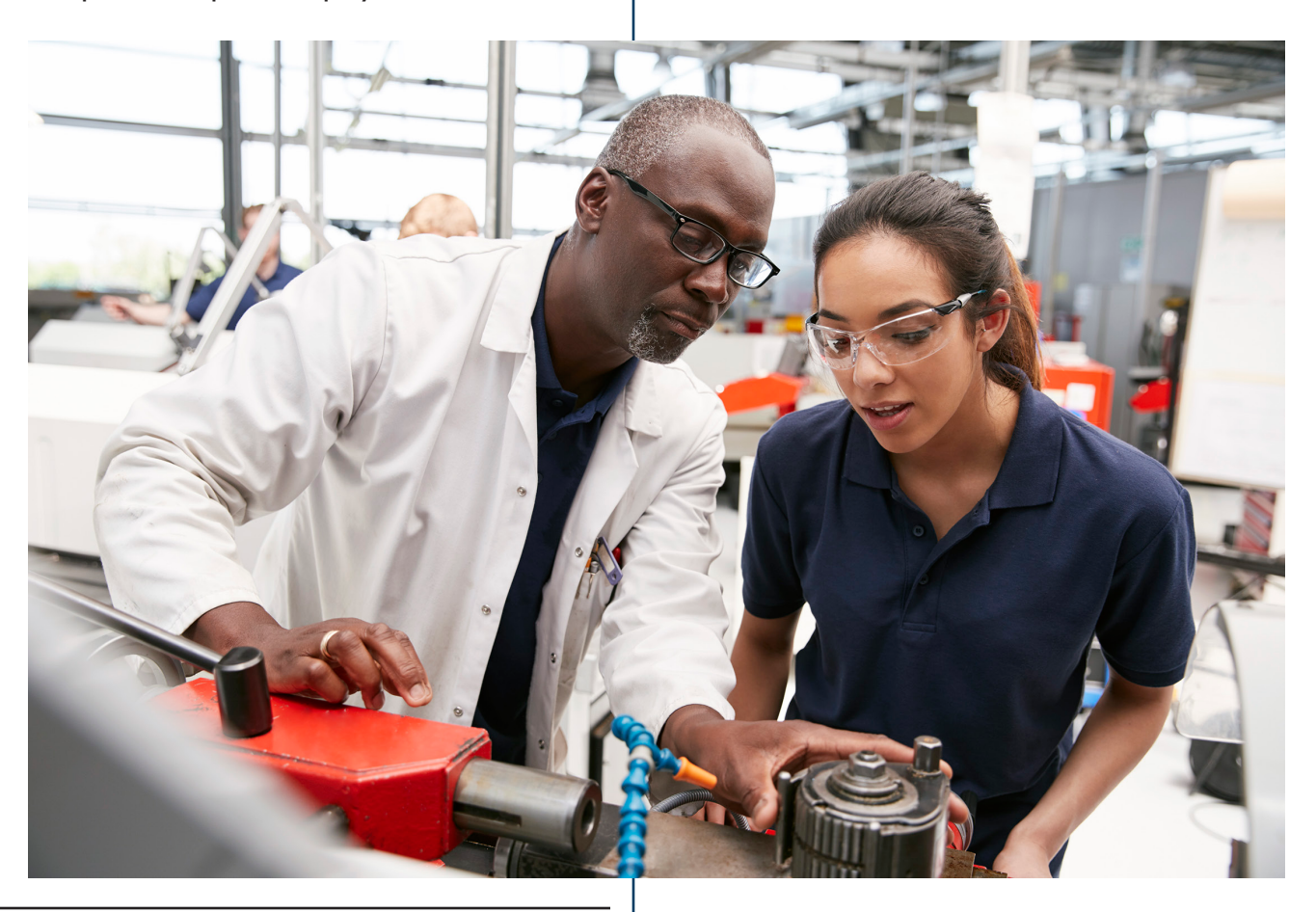
5 Groger, A. (2020, December 20). Desegregating work and learning through 'earn and learn' models. Brookings. Retrieved September 16, 2022, from https://www.brookings.edu/research/desegregating-work-and-learning/

Optimal training models—apprenticeships, internships, OJT, co-operative education, externships, and transitional jobs—are presented and described below. When viewing the populations served for each model, think of the individuals listed as examples and as prompts for identifying who can benefit from each model.