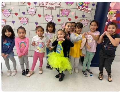
National School Counseling Spirit Week