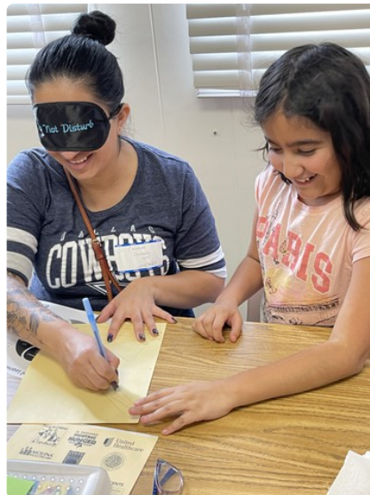
5th Grade Parent Workshop