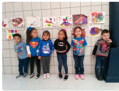
National School Counseling Spirit Week