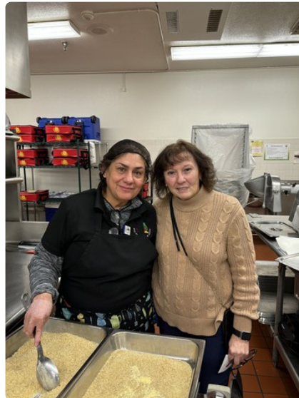
National Compliment Day