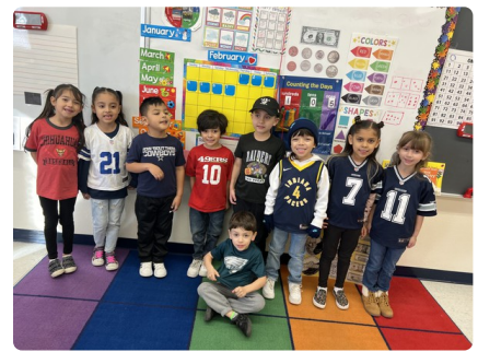
National School Counseling Spirit Week