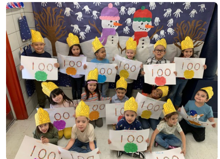
100th Day of School