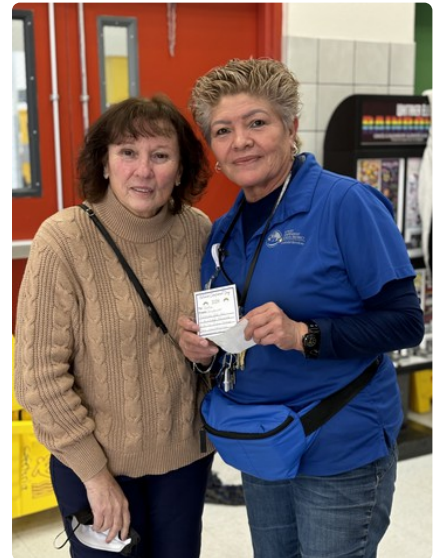
National Compliment Day