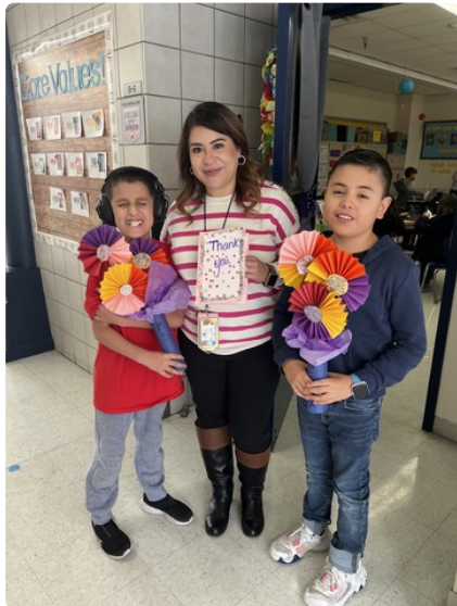
National School Counseling Week