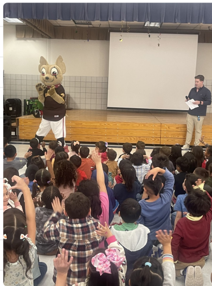
Chico Drug Prevention Presentation (PK-2nd)