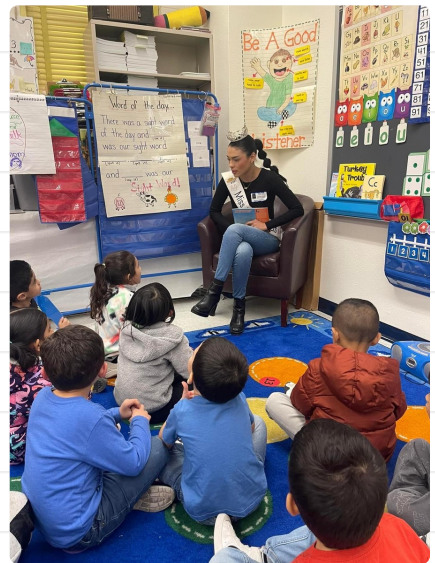
Miss West Texas Campus Visit