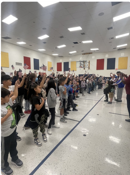
Veterans Presentation (3rd-5th)